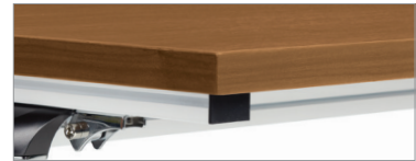
Table tops available in a large variety of veneer finishes (Latte Walnut shown)