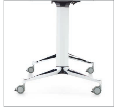
Vertical upright available in Black, Tungsten, Nevada, Taupe, Silver and Storm Grey (Designer White shown)