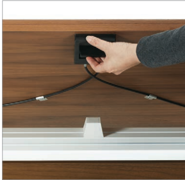
One handed flip up operation