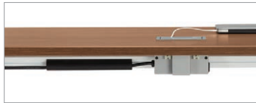
Optional wire management snap-in channel