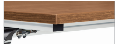
Table tops available in a large variety of laminate finishes (Walnut Heights shown)