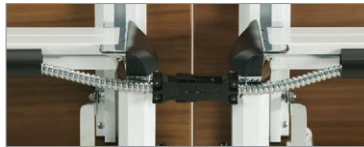
Optional daisy chain power management