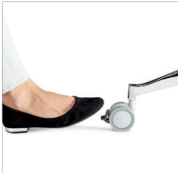
Locking dual wheel casters swivel 360°