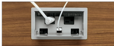
Optional power block includes power and data